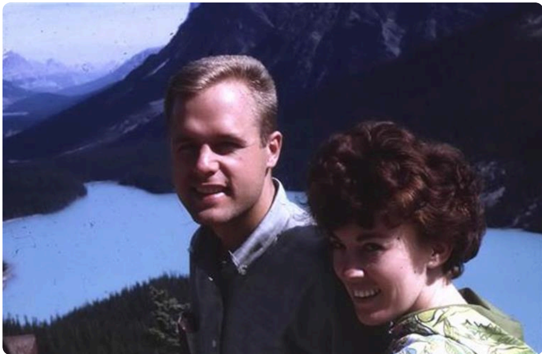
Peyto Lake Alberta